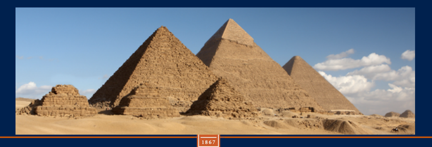
Sport+Development Lab at UIUC